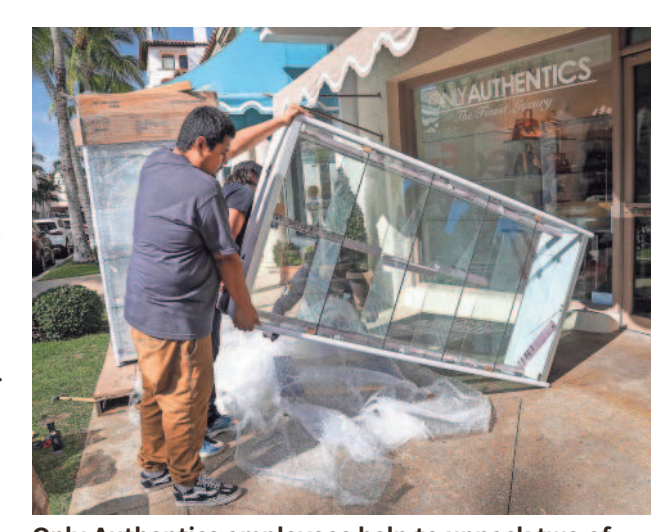
Only Authentics employees help to unpack two of the new display cases that will now be used in the Worth Avenue boutique. Two smash-and-grab thefts have seen a total of 21 Hermes handbags stolen.

The case is "still an open and active criminal investigation," Palm Beach Police spokesman Capt. Will