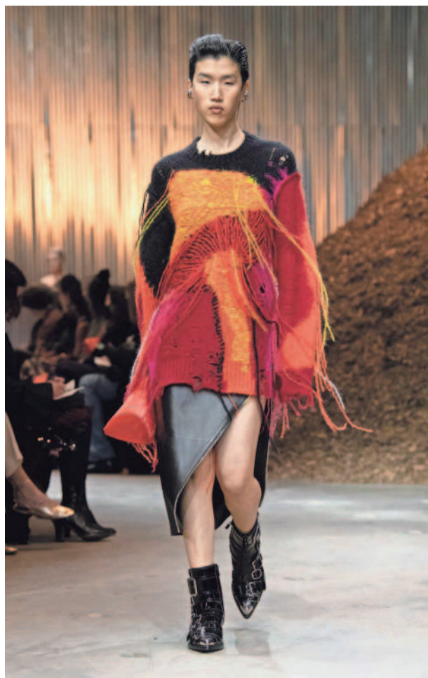
A model in the Alexander McQueen fall 2022 fashion show. The luxury brand held its first New York runway show in more than 20 years.