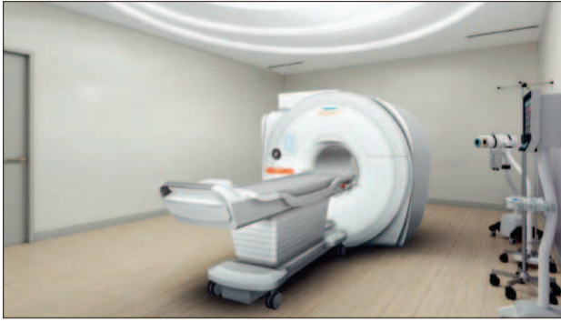
Sollis Health Imaging Room